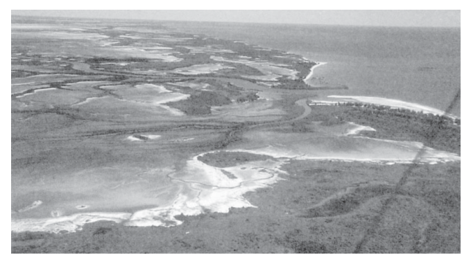
Gulf, looking south from Brannigans river

Also involved were scientists from Australian Quarantine Inspection Service (AQIS), who were taking blood samples from some of the birds caught, to look for avian viruses, which the waders might be bringing from Asia.