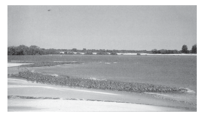
Red and Great Knot at Brannigans

In spite of the hazards the Gulf is a remarkable place. One needs an aerial view to appreciate just how vast it is, and why it has taken so long to get into the area in the wet season to study the birds. Another unusual aspect of the areas are the tides. There is just one high tide a day, not the usual two we are used to at Miranda and added to this, during a neap tide period there are about 48 hours when the tide hardly moves in or out, but is stuck approximately half way. There is a period in the tidal cycle when the high tides only occur at night, so counting high tide roosts is not possible. Then there is a period when the high tides are all during the day, which is good for counting, but the birds need to feed more at night, when they may be less efficient feeders.