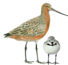
Pūkorokoro Miranda Shorebird Centre

1. Colour in these three images of a flying Pacific Golden Plover, glue them to thin cardboard if you want to make your bird stronger, and then cut them out.